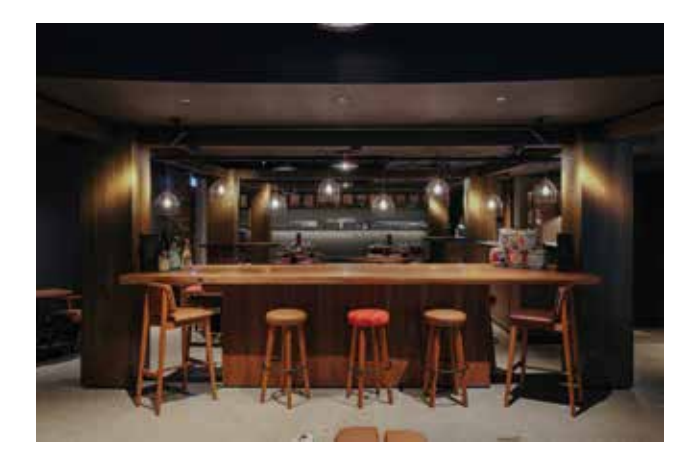
Seated 70, Cocktail 100