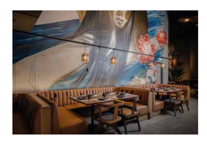
Seated 80-90, Cocktail 150